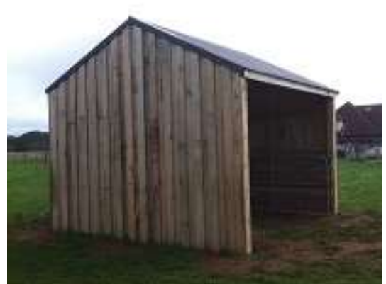
The timber shelter on the right has a 3.6m gate which is currently folded inwards so the shelter can be used as a walk in-walk-out shelter, but the gate can swing out (180 degrees) and then shut to contain the horse in the shelter. Gates can be added to shelters as required.